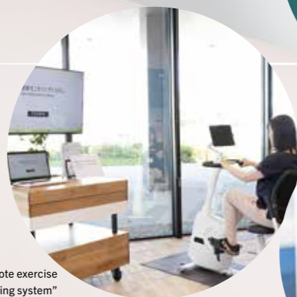
“Remote exercise monitoring system” displayed at Air Water Kento.